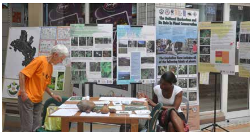
PCA displays: Earth Day (22 April): “The Face of Climate Change” (left) and Biodiversity Day (22 May): “Water and Biodiversity”.