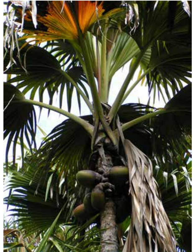
Coco de Mer palm (L Chong-Seng).

mother and father of a particular juvenile? How far does pollen travel? Are there genetic differences between populations? What sex are the seedlings and juveniles? How inbred is each population?