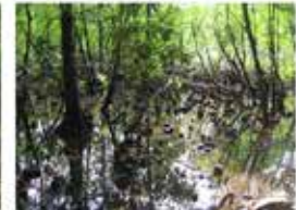
Mangrove trees have built-in snorkels! The soil is so muddy and water-logged that there is not enough air in it. So the pencil-like breathing roots of Mangliye blan and the knee-like roots of Mangliye lat allow these mangrove trees to breathe when the tide is low.