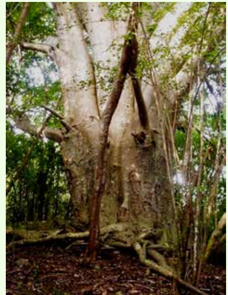
The giant trunk of the Baobab on Ste Anne Island measures 5 metres in circumference

PCA member, Andre Dufrenne, who works on Ste Anne Island (not far from Mahé), notes that there is a magnificent old Baobab tree on the island, quite close to one of the small roads constructed during the 1980s. Baobab ('Moulapa' in Creole) is an introduced species in Seychelles and relatively rare. In fact 2 different species of Baobab have been introduced, both probably in the late 19 th Century. Globally, there are 8 species of Baobab ( Adansonia ), 6 of them native to Madagascar, 1 in Africa and Arabia, and 1 in Australia. The one on Sainte Anne is Adansonia digitata (the African species), the same species as the well known trees on La Digue. Both have huge trunks, with all the branches concentrated near the top of the tree. The leaves are palmate and the large velvety fruits are oval. Apparently the dried pulp of the fruits is edible, as are the leaves, but Seychellois don't normally eat them. Another species, Adansonia madagascariensis can be found for example at La Plaine St Andre on Mahé. This species also has palmate leaves but the fruits are smaller and round.