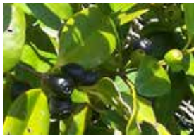
Bwa kalou Memecylon eleagni