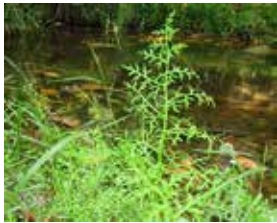
Kreson lanmar Ceratopteris cornuta