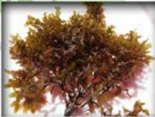
Two different brown seaweeds (algae)

We sometimes forget that seaweeds and sea grasses are really plants. Mosses are very small plants, so we tend to overlook them. And what about those strange patterns on rocks and tree bark - are they plants too? And what about mushrooms and toadstools?