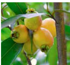
Zanbroza Syzygium jambos