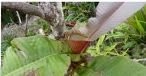
Personal water-collection system! Young leaf of Bwa rouz