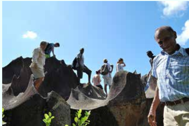
Moyenne Island - Shady open woodland and spectacular eroded granite boulders with a view of the nearby islands of Ste Anne Marine National Park