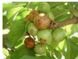
Vavang Vangueria madagascariensis