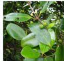
Leaves of Takamaka, Bwa ponm and Bwa kalou. Thick leathery leaves have a protective waxy layer that reduces evaporation of water. The glossy surface reflects excess heat and light.