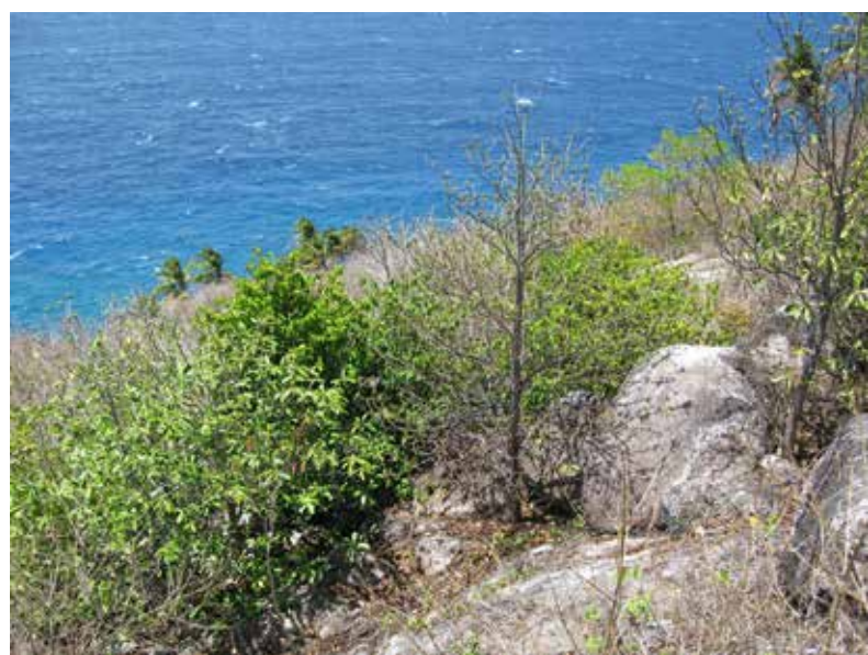
The same rehabilitated rocky area of North Island on 28 Aug 2010, after 1 year of drought, and 01 Sept 2012, after 3 years of drought.