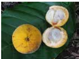
Santol Sandoricum koetjape