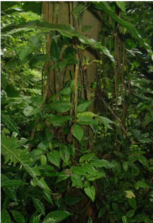
Piper silhouettanum , known only from one locality in the “Pisonia forest” (= “Dans Mapou”), on Silhouette (B Senterre).

We often hear or think that the rarest plant of Seychelles (and maybe of the world) is the famous Bwa mediz ( Medusagyne oppositifolia ). This plant is indeed restricted to Seychelles (endemic) and it can be seen in a very limited number of sites. But how can we define and quantify “rarity”, and are there other species even rarer than Bwa mediz? These are actually difficult questions and regardless of definitions (e.g. Gaston & Fuller 2009; Kunin & Gaston 1997; Rabinowitz 1981), the native species of Seychelles have never been ranked for rarity. Important studies have been done, but focusing mostly on the endemics (Carlström 1996, Gerlach 1997, Huber & Ismail 2006, see also Kapisen No. 1 p.8, No. 3 p.14, No. 6 p.15).