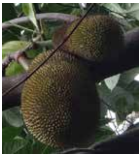
Zak Artocarpus heterophyllus