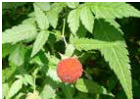
Franbwaz Rubus rosifolius