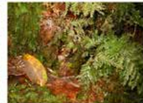
Mosses and Filmy ferns with tiny leaves, very thin and lacey.