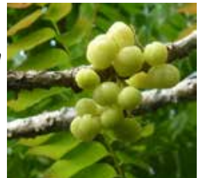
Bilenbel Phyllanthus acidus