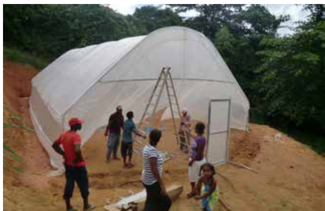
Building the nursery for rare and unusual crops.

We have started a project to collect and save old, neglected and rare local food crops. Many older varieties of agricultural crops are no longer cultivated, either because they have become rare or are less productive, or farmers simply prefer to buy newer high-yield varieties from overseas. Also, consumers lack awareness about these old food crops so there is little demand on the market, particularly amongst the younger generation. But if this continues, we will