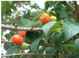
Rousay Eugenia uniflora