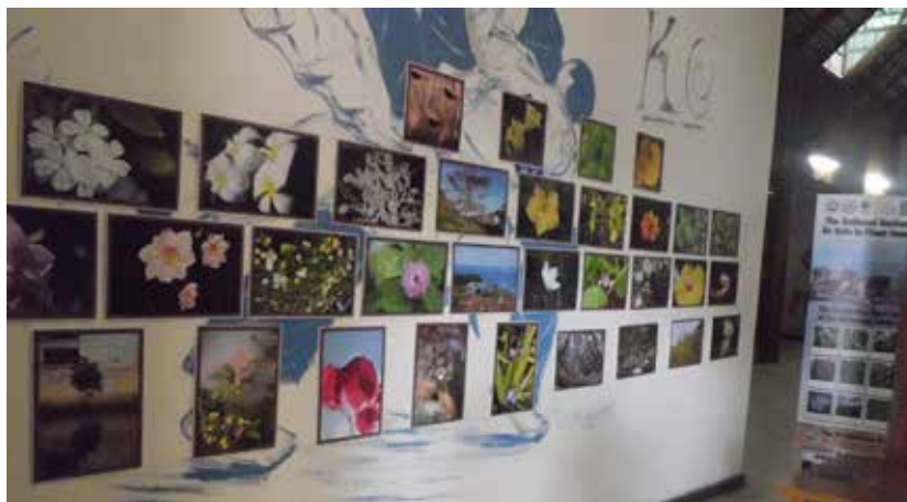
Plant Photo Competition winning photos displayed at a community centre on Praslin (SIF).

As well as taking the main PCA plant exhibition from the capital, Victoria, out to communities in other areas of Mahé, at the end of 2012 we took the Plant Photo Competition Exhibition (Kapisen 14, pp 10, 11, 16) even further afield, to the island of Praslin. The display was mounted at both the community centres on Praslin, as well as at the Visitor Centre of Vallée de Mai World Heritage Site, with the assistance of Seychelles Islands Foundation (SIF).