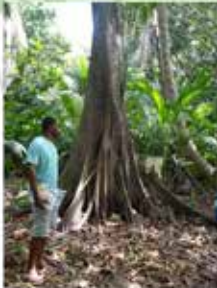
The buttress roots of Bodanmyen keep the tree firm in loose sandy soil.