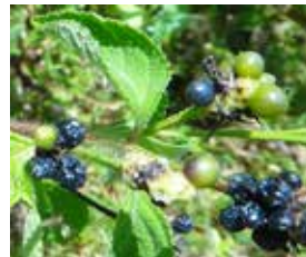
Vyeyfiy Lantana camara