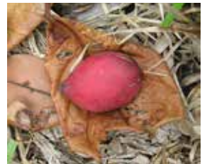
Bodanmyen Indian almond Terminalia catappa