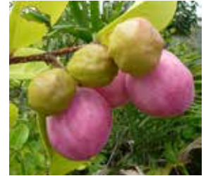
Prindefrans Chrysobalanus icaco