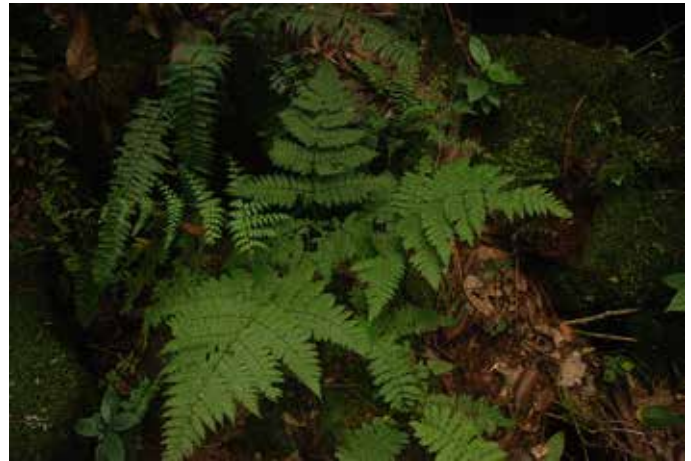
Lastreopsis hornei in a montane ravine close to Morne Seychellois; last seen by Horne in 1870s; rediscovered in 2011 (B Senterre).

Over the past few years, further work has been enabled through the ‘Herbarium Project’ (Kapisen 13), which has resulted in a large database of knowledge on the flora of Seychelles and on species distribution. This has been lately augmented through a major study on Seychelles Key Biodiversity Areas (KBA) in the inner granitic islands, funded by GEF, in which PCA was also a leader. These recent studies allowed us to assess with more detail the rare plants of Seychelles.