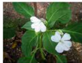
Belzamin sovaz Thin, soft, dark green leaves that easily dry out.