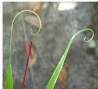
How to climb higher to get more light! Leaf tendrils of Zolivav and Lalyann potao