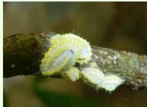
New mealy bug pest of Papaya - on fruits (top, right) and on underside of leaf (lower, left); lower, right - another common mealy bug (K Beaver).