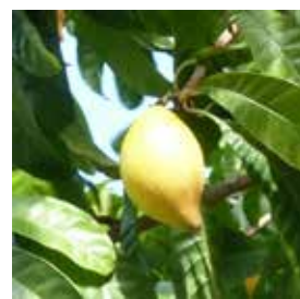
Sapot Pouteria campechiana