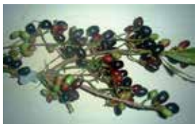
Zanblon Syzygium cumini