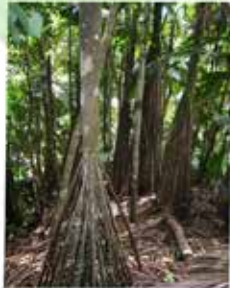
The stilt roots of Latannyen lat and Vakwa parasol keep the trees firm at river edges and on steep slopes.