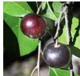
Prin Flacourtia jangomas