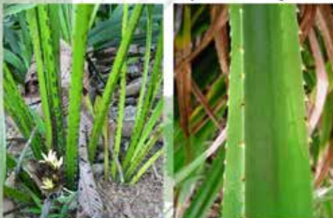
Leaves with a defense system! Vakwa and Koko maron