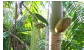
Palmis Deckenia nobilis