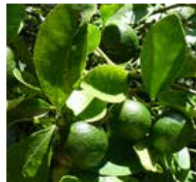
Bigarad Citrus reticulata