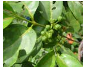
Bwa dir Pyrostria bibracteata