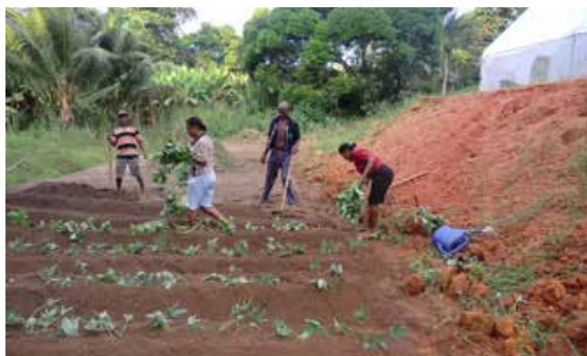
The farmers planting a variety of Patat (Sweet Potato) near the nursery

We are happy that the Seychelles Agricultural Agency provided land on which we could build our nursery as our project is meant to contribute to national efforts. Although the project is a local community initiative, we hope that our work will spread beyond the Val d'Andor community. We plan to produce educational and awareness information so that many people can become interested and involved in the conservation of rare crops. They could provide us with more seeds and planting material or they may wish to grow some of these crops themselves, either on farms or in home gardens. So we will sell plants to the public at appropriate national events, such as the National Expo in June. We also want to encourage more people to consume these crops, so we may have to find new recipes for them to try. In October we shall be selling plants at a Tambola and "Manze Kreol dan leo Val dendor".