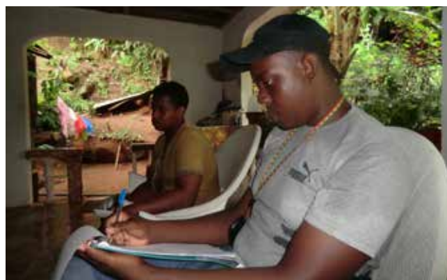
Collecting and recording rare crop information from local residents.

Our project started towards the end of 2012 and has the support of the Seychelles Agricultural Agency (SAA), and we are supported by funding from the GEF Small Grants Programme. So far we have established an inventory of these crops; we have provided training for members of the Val d'Andor farmers association and their families about how to research these crops, as well as for other interested individuals in the community; and we have built a nursery in which to raise the crops and to produce further seeds for propagation. We have already collected a significant number of the crops featured in the inventory but we need to extend our efforts to further afield and collect plants from different locations.