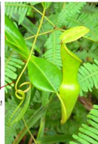
Super insect food catcher! - a leaf extended into a pitcher, which contains a digestive liquid and has a very slippery surface.