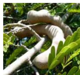
Tanmaren Tamarindus indica