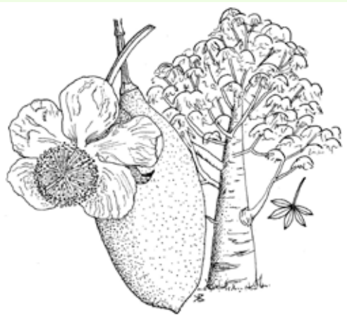
Flower, fruit, adult tree and leaf of Adansonia digitata (drawing by K Beaver from "Nature Trails and Walks in Seychelles, No. 10 La Digue", 1990)