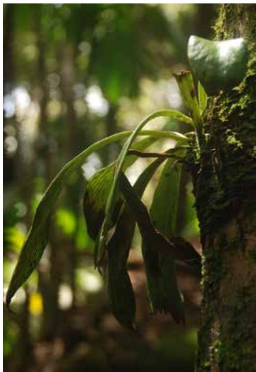
Antrophyum callifolium on a trunk of Latanyen fey at Jardin Maron (Silhouette); this is the only known individual; last seen by Horne in 1870s; rediscovered in 2012 (B Senterre):.

Another of the rarest endemics was recently rediscovered by us, and this is Lastreopsis hornei . This plant is a relatively large fern (up to 70 cm high) which had been seen only in the 1870s, by Horne. It is really a rare species, found only in the lower montane forest and especially in the tree fern belt (Senterre 2011) of Mahé and Silhouette. Each population is known from just a few individuals, clumped into deep ravines. What is also interesting about this species is that when Horne collected it, he missed the rhizome of the plant. Unfortunately, rhizome scales include the key characters to distinguish several closely related species found in Madagascar. So now that we have a rhizome specimen we can find out whether our rediscovery will confirm its endemism.